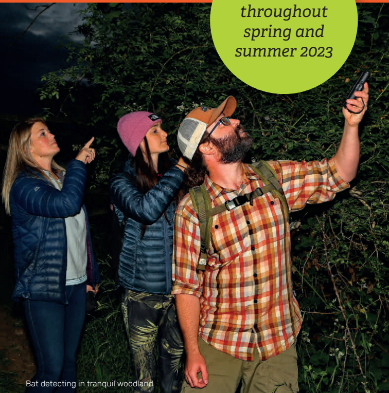
Bat detecting in tranquil woodland

Dates available throughout spring and summer 2023